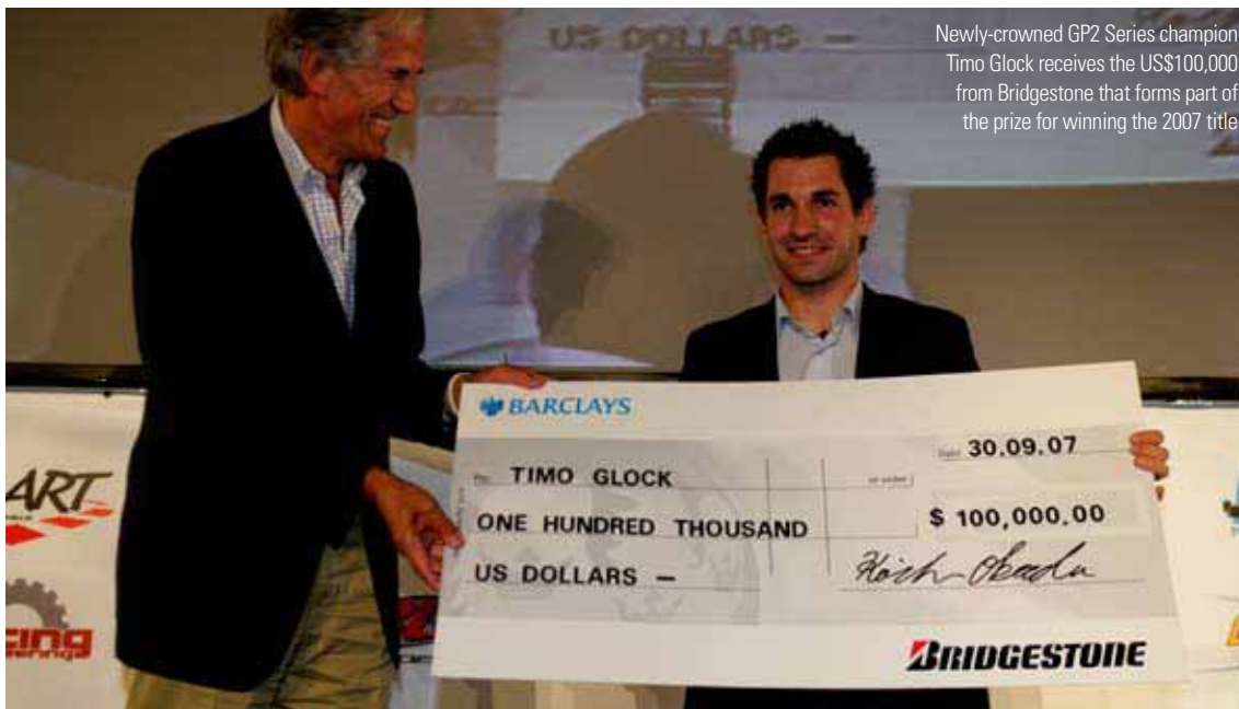
Newly-crowned GP2 Series champion Timo Glock receives the US$100,000 from Bridgestone that forms part of the prize for winning the 2007 title

On lap 31, Schumacher's right-rear tyre failed after he ran over some debris from an earlier incident. With no other driver left to challenge him, the title was Häkkinen's – the first for a Bridgestone-shod driver, kickstarting a run of seven back-to-back titles during the next seven years.